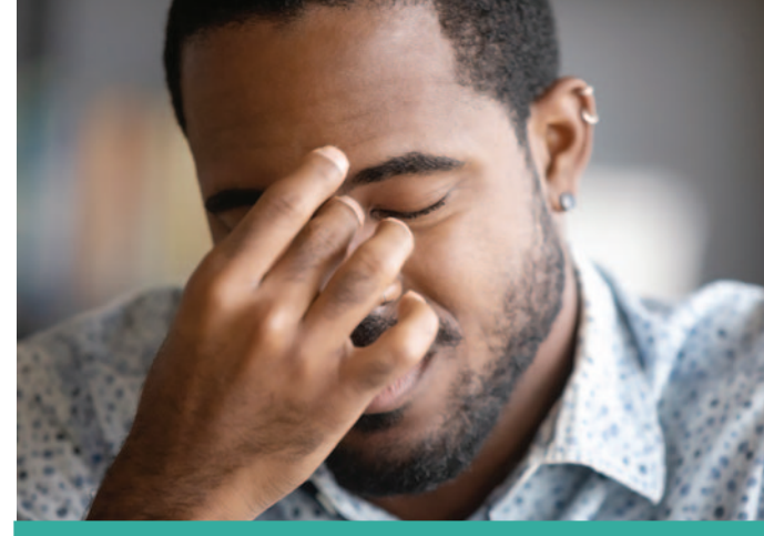
>> For more information on blood health, visit www.hematology.org

factors to consider for healthy blood. Your blood sugar level can affect your energy levels. Nicotine, exercise and diabetes can